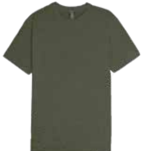
MILITARY GREEN HEATHER