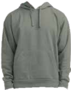
MILITARY GREEN HEATHER