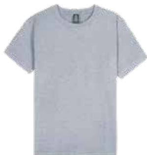
DARK GREY HEATHER