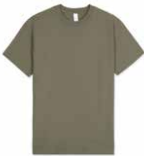
MILITARY GREEN HEATHER