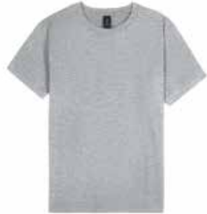
DARK GREY HEATHER