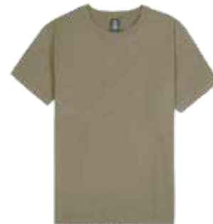
MILITARY GREEN HEATHER