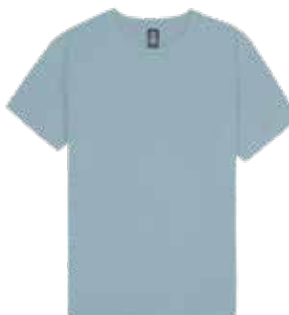
MOSSY GROVE HEATHER