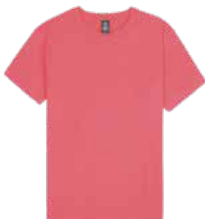
CC RED HEATHER