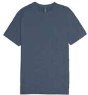
DARK NAVY HEATHER