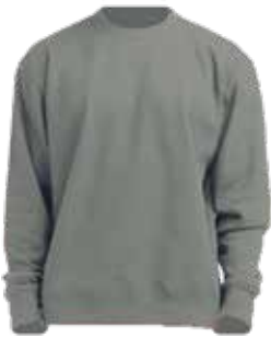
MILITARY GREEN HEATHER