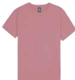
DP RED HEATHER