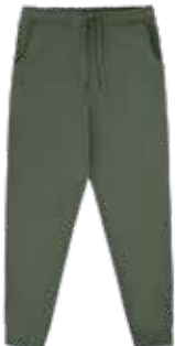
MILITARY GREEN HEATHER